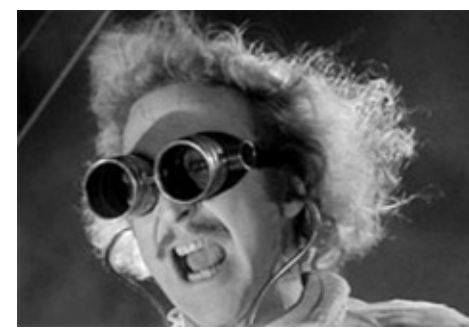
Gene Wilder as Young Frankenstein (1974)