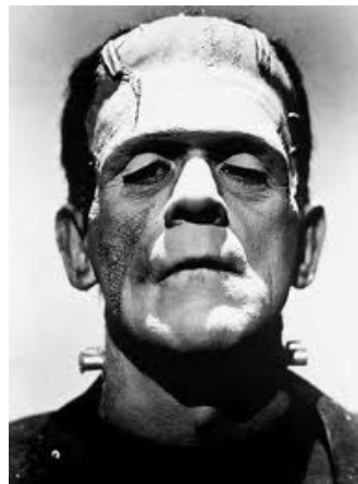
Boris Karloff as F's monster (1931)